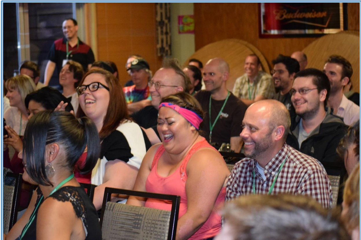
Some of the largest (and laughingest) audiences at the Conference attend the Fringe.