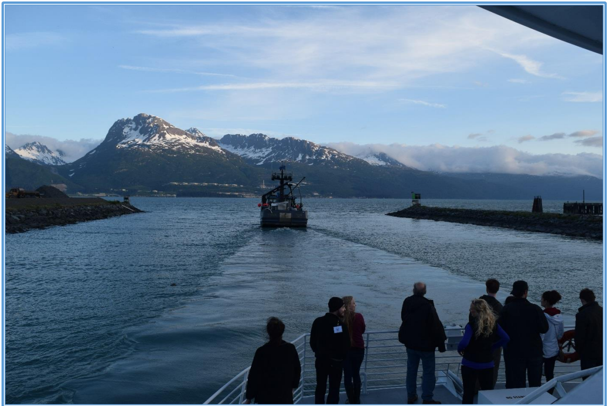
Heading out on the Friday evening Stan Stephens Cruise.